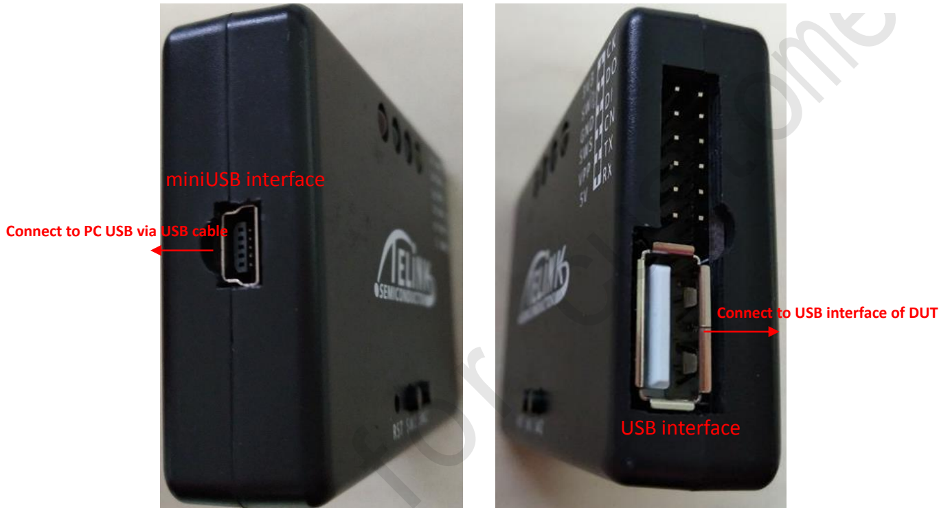
Figure 4 Connection chart 2 to download FW into DUT via TLSR8266BR56