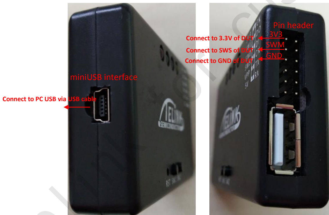
Figure 3 Connection chart 1 to download FW into DUT via TLR8266BR56