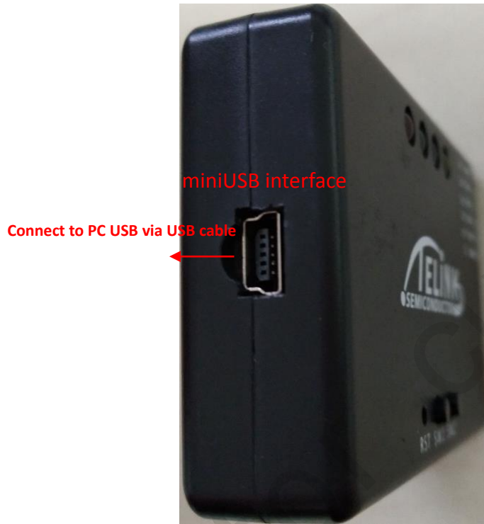
Figure 2 Connection chart to supply power for TLSR8266BR56

Connect the miniUSB interface of the TLSR8266BR56 with PC USB via a mini USB cable.